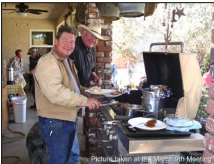
Picture Taken at the March 9th Meeting

From the 14 Freeway, go west on Avenue N passed 20 th Street West, to the first dirt field (lot B) on the right. "Look for Tractors".