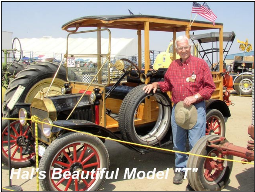
Hal's Beautiful Model "T"

Here is a picture of Dennis's 1950 Case, Orange Tractor, at the 2011 AV Fair