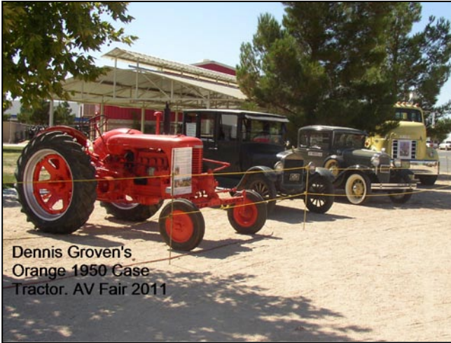
Dennis Groven's Orange 1950 Case Tractor. AV Fair 2011

Dennis Groven showed at the last 2012 show at the AV Fair.