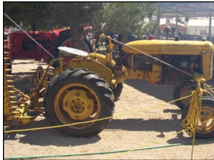
David Pickus - Yellow Farmall Tractor with Sickle. Lancaster, Ca.