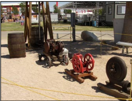
Another fine display of Antique Engines, Water Pumps & Water Tower, by Jerry Wood. Tehachapi, Ca.