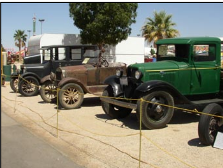
Pictured on lower right, is the Clubs 1934 V8 Ford A/A Truck.