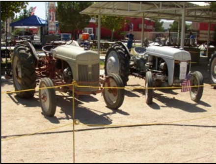
Steve Sturdevant's - nice display of three Ford Tractors. Two shown in picture. Lancaster, Ca.