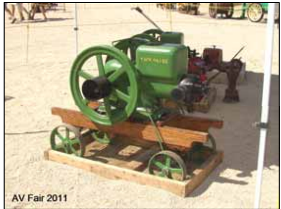
AV Fair 2011