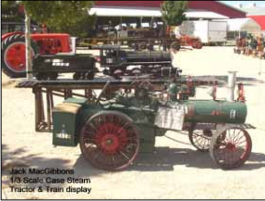
Jack MacGibbons 1/3 Scale Case Steam Tractor & Train display