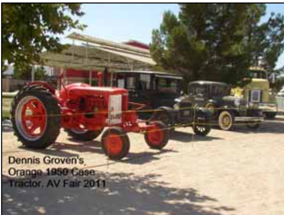
Dennis Groven's, Orange 1950 Case Tractor. AV Fair 2011