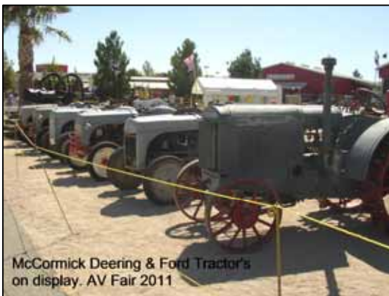
More..... McCormick Deering & Ford Tractor's