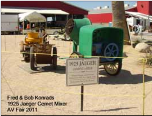
Fred & Bob Konrads 1925 Jaeger Cemet Mixer AV Fair 2011