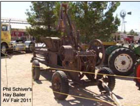
Phil Schiver's Hay Baler AV Fair 2011

Phil Shiver's Working Hay Baler on Display & Running