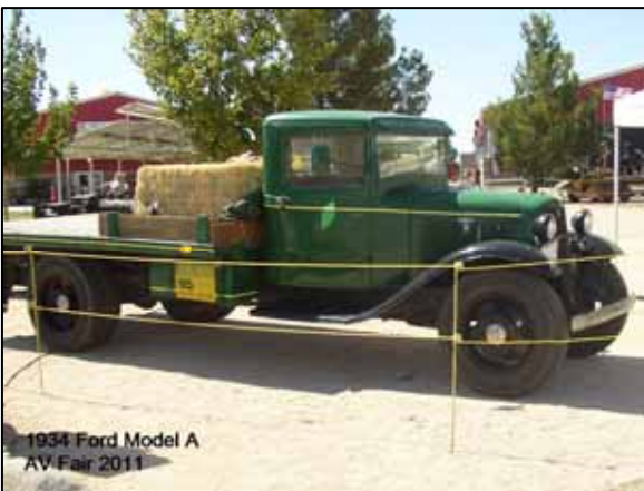
1934 Ford Model A AV Fair 2011

Ottis & Bea Fairchild's 1934 Model "A" Ford