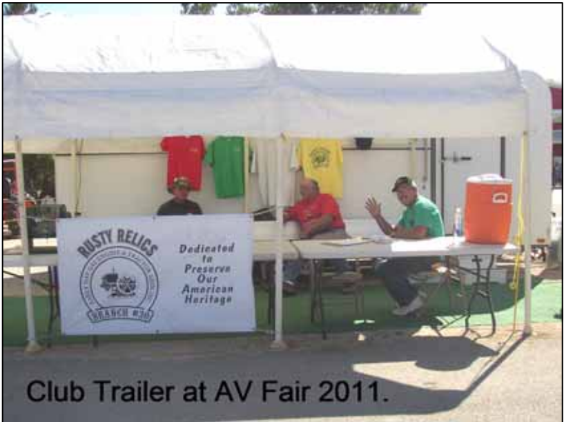
Club Trailer at AV Fair 2011.

Glad You Came to the Fair, see you all, in Silver Lakes!!!!!!