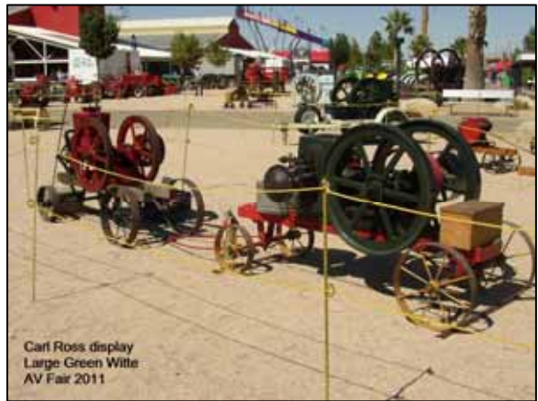
Carl Ross display Large Green Witte AV Fair 2011

Carl Ross's nice display of Engines. The large Green Engine is a 1917 6 HP Witte. The Smaller engine is a 1917 4 HP Bullseye. Both are Hit & Miss