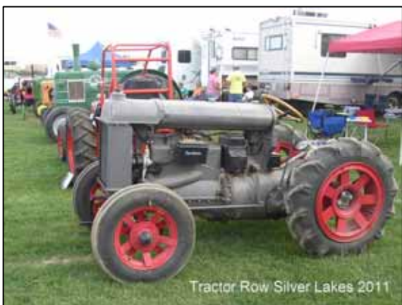
Tractor Row Silver Lakes 2011