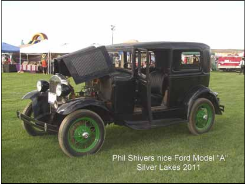
Phil Shivers nice Ford Model "A" Silver Lakes 2011