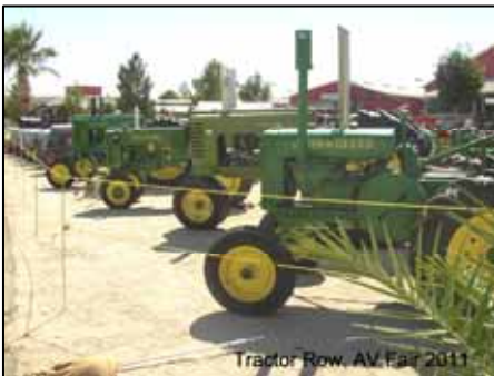
Tractor Row, AV Fair 2011

Some more pictures from the 2011 AV Fair. Scott Wachlin's Green Oliver Crawler and some more Bright Red Farmall's.