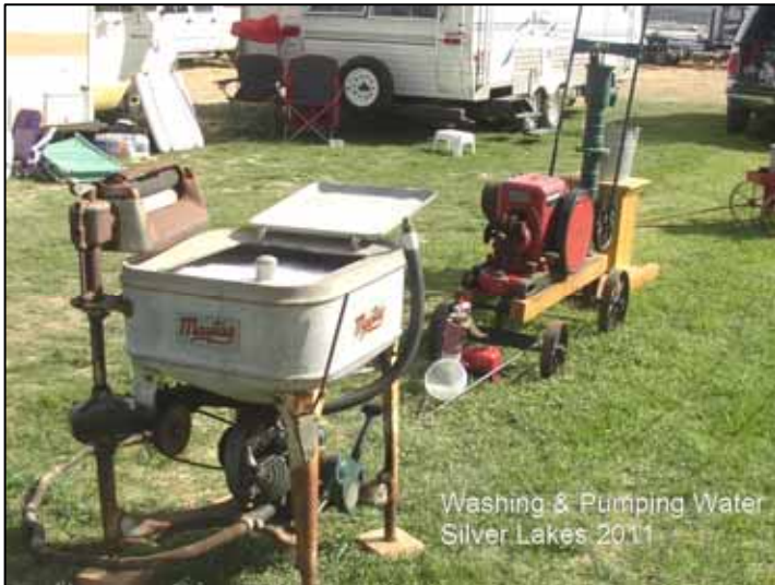
Ron Hanson washed some clothes & pumped some water.