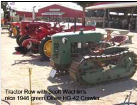
Tractor Row with Scott Wachlin's nice 1946 green Oliver HG-42 Crawler.

This picture had the wrong caption, in the Sept. Tractor Seat. This is a nice display from Ron Zega. AV Fair 2011. We're sorry for the mix up. Your editor.