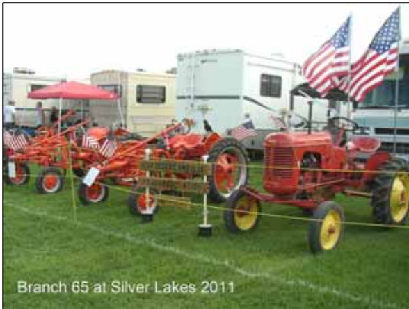
Branch 65 at Silver Lakes 2011

Some Red Farmall's and Orange Tractor's from Branch 65.