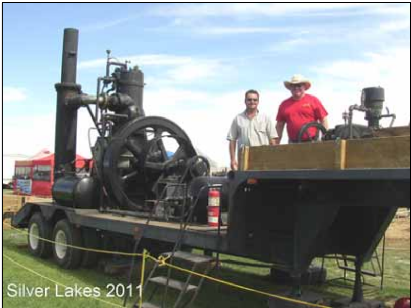
Silver Lakes 2011