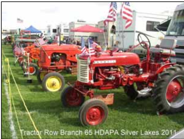
Tractor Row Branch 65 HDAPA Silver Lakes 2011

Some Red Farmall's and Orange Tractor's from Branch 65.