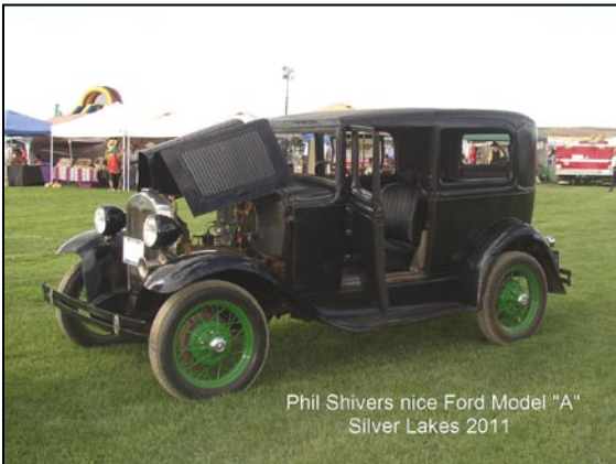
Phil Shivers nice Ford Model "A" Silver Lakes 2011

From the 14 freeway, go west on Avenue N passed 20 th Street West, to the first dirt field (lot B) on the right. "Look for Tractors"