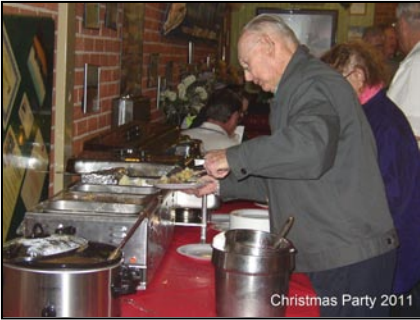
Christmas Party 2011