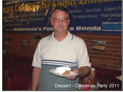
Dessert - Christmas Party 2011